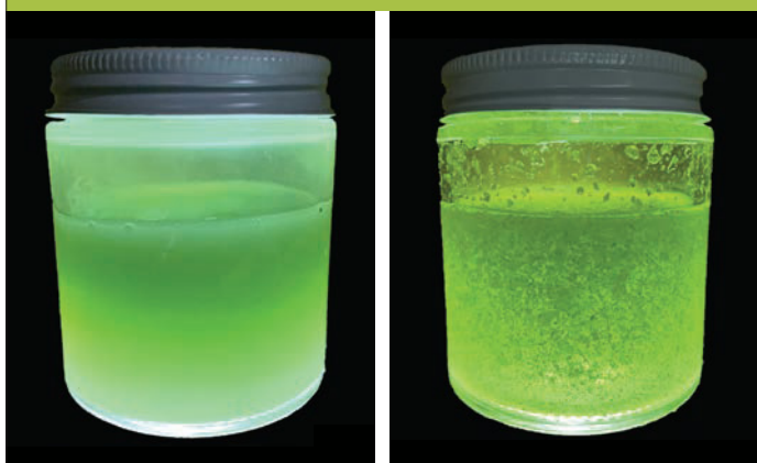
Midac ® 4 + 10-34-0