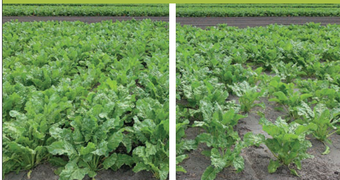
Midac ® Treated